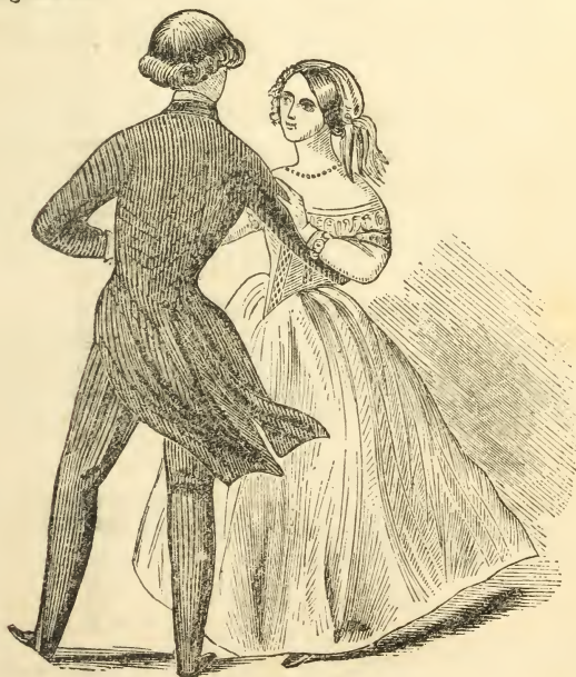
FIVE STEP WALTZ.

The waltzer must always recommence with the left foot. In the three times the waltzer must make a half turn, as in the old three time waltz; scarcely turn at all in the fourth, and make the second half turn in the fifth, upon the little glissade. Lady commences with the right foot.